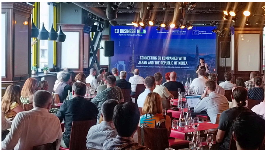
Photo: EU HUB launch event, in Cluj-Napoca., June 2024